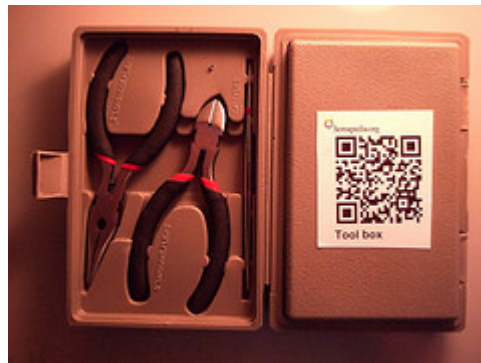
Fig. 2. A tool box tagged with QR code